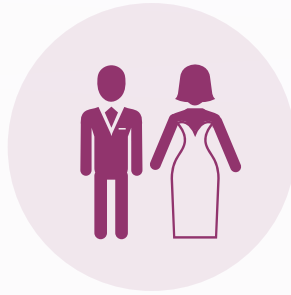
MARRIAGE AND FAMILY LIFE MINISTRY